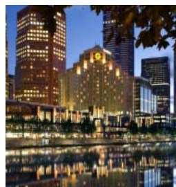
The Langham, Melbourne