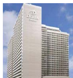
Chelsea Hotel, Toronto