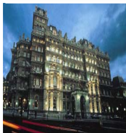
The Langham, London