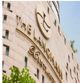
The Langham, Xintiandi