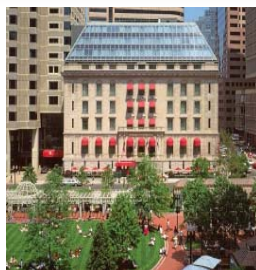
The Langham, Boston