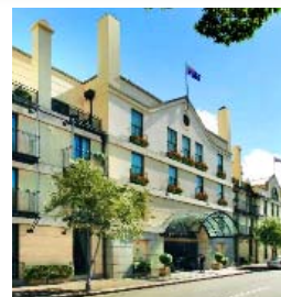
The Langham, Sydney