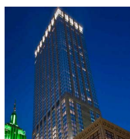
The Langham, New York