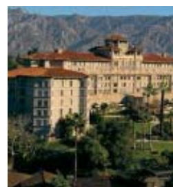
The Langham, Pasadena